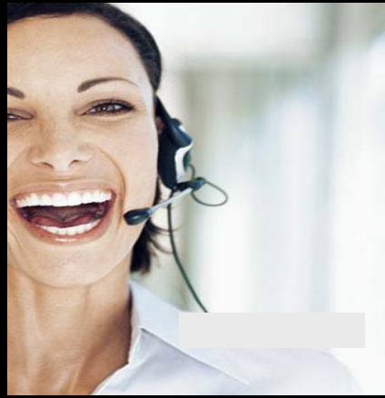
Experiences and perceptions of customer service.....