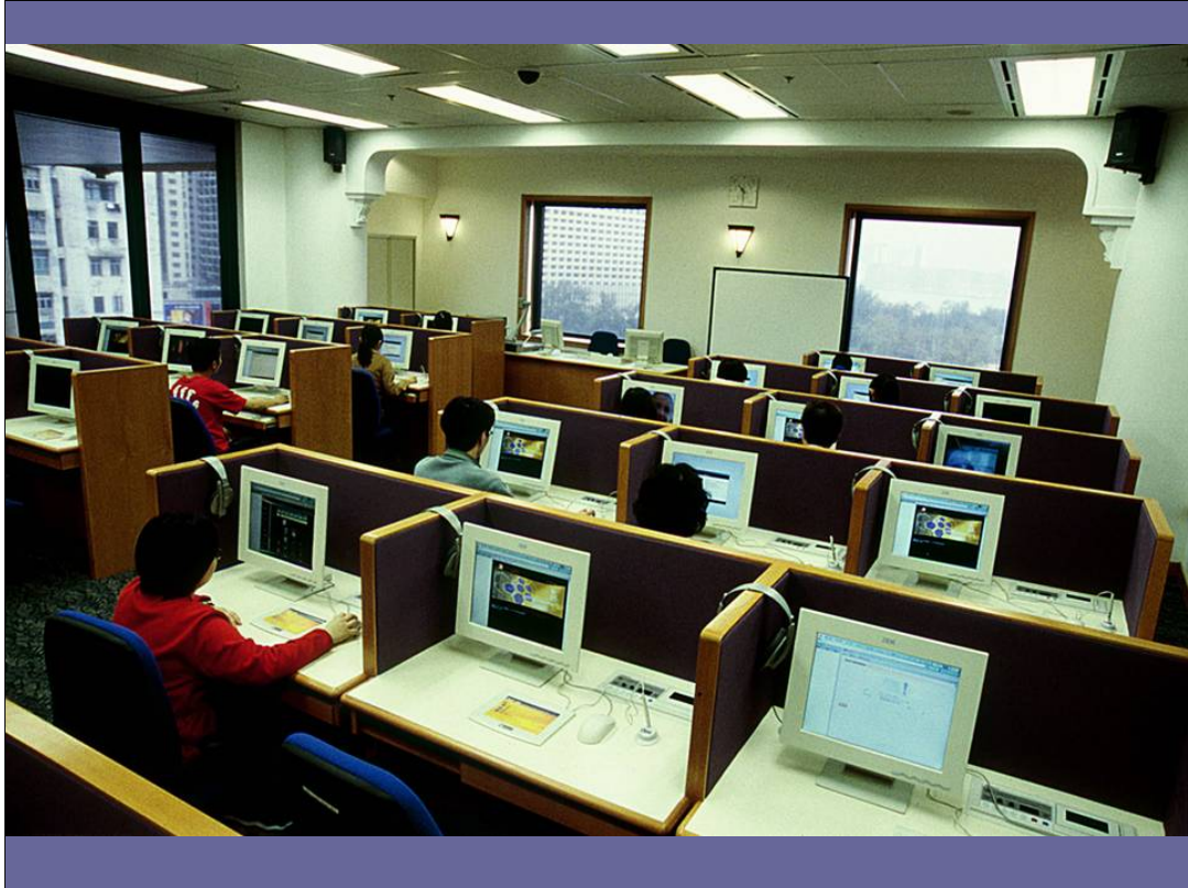
Room providing internet access. There's also a room for learning programs, a lecture theatre, a library shop and a library café.