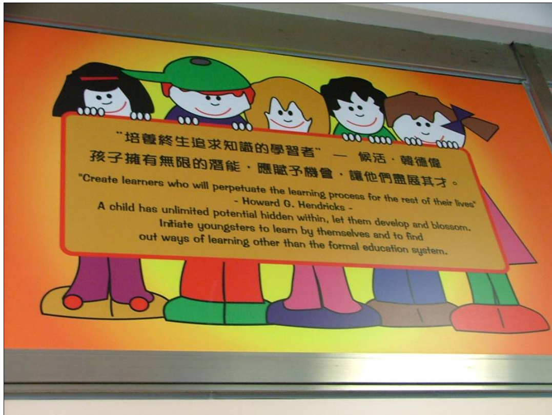
The children's area in City Hall Library – it's all about learning.