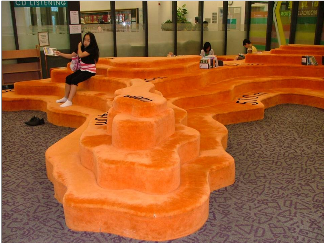
The children's area at Ma On Shan Public Library. This seating area represents the contours of a map.