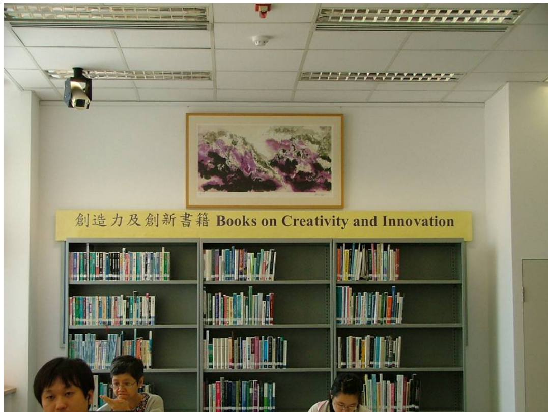
The Creativity and Innovation collection is a special feature of City Hall Library.