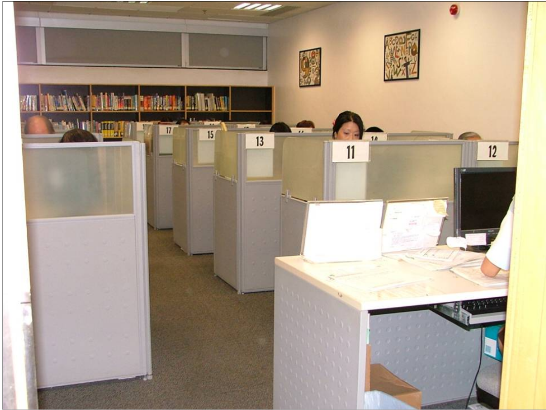
Internet users in Ma On Shan Public Library.