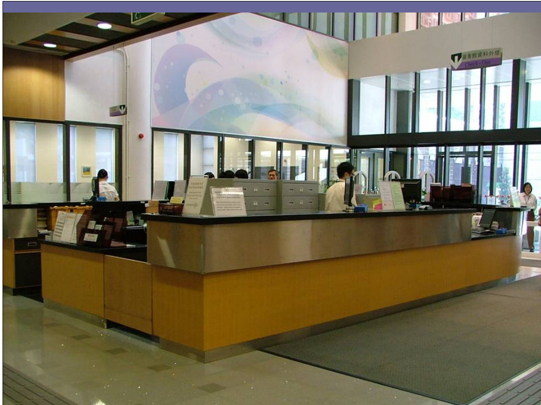
A large traditional-style circulation desk is right at the main entry/exit point of the library.