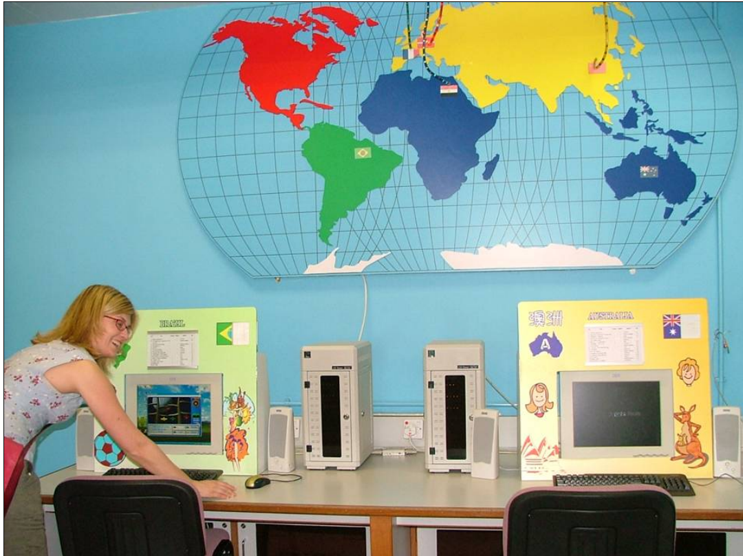
The children's multimedia room in City Hall Library.