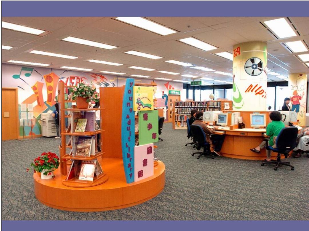
The young people's area in the Hong Kong Central Library.