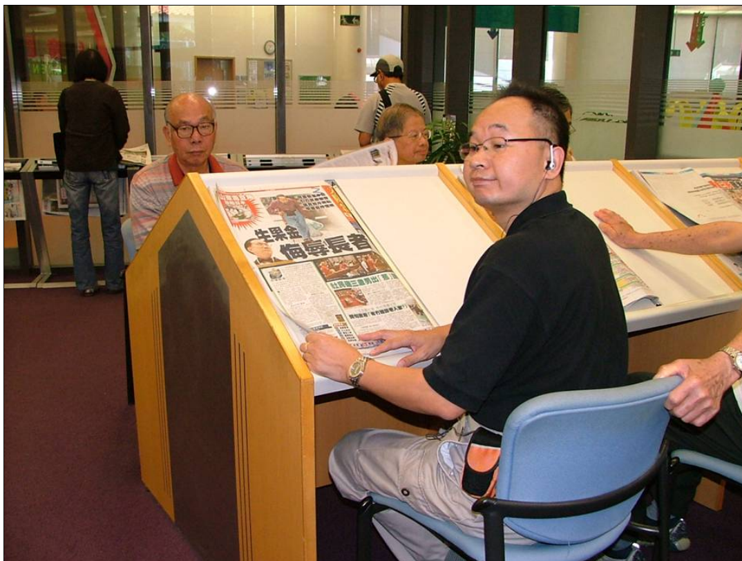
The newspaper room in Ma On Shan Public Library.