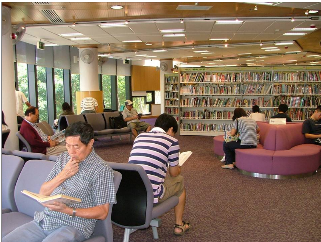
The main adult area of Ma On Shan Public Library.