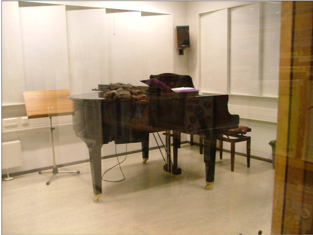
Sello Library's soundproofed music room containing a grand piano.