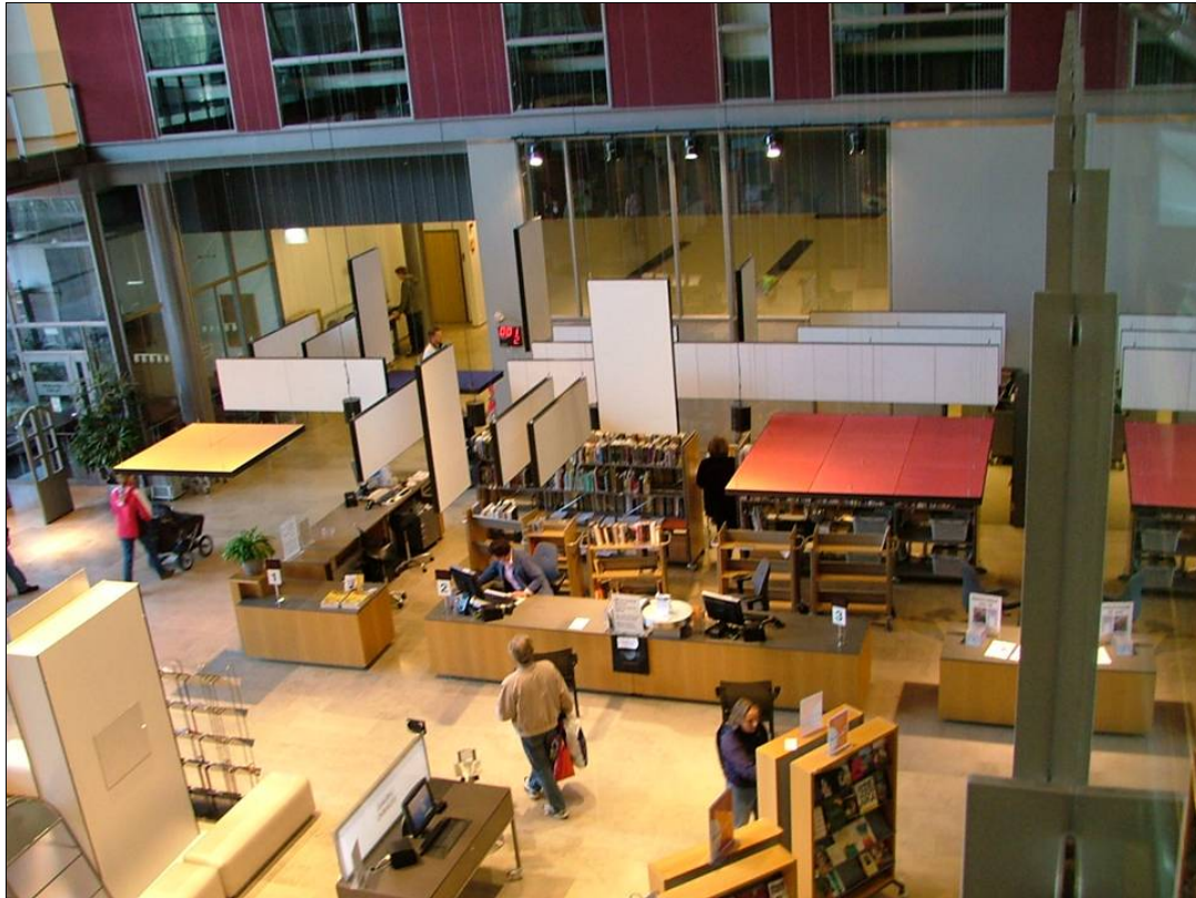
Part of the vast foyer of Sello Library containing a lounge area, display of library materials, a temporary exhibition (not shown) and a very big customer service area (although the overwhelming majority of loans are self-check by the library user).