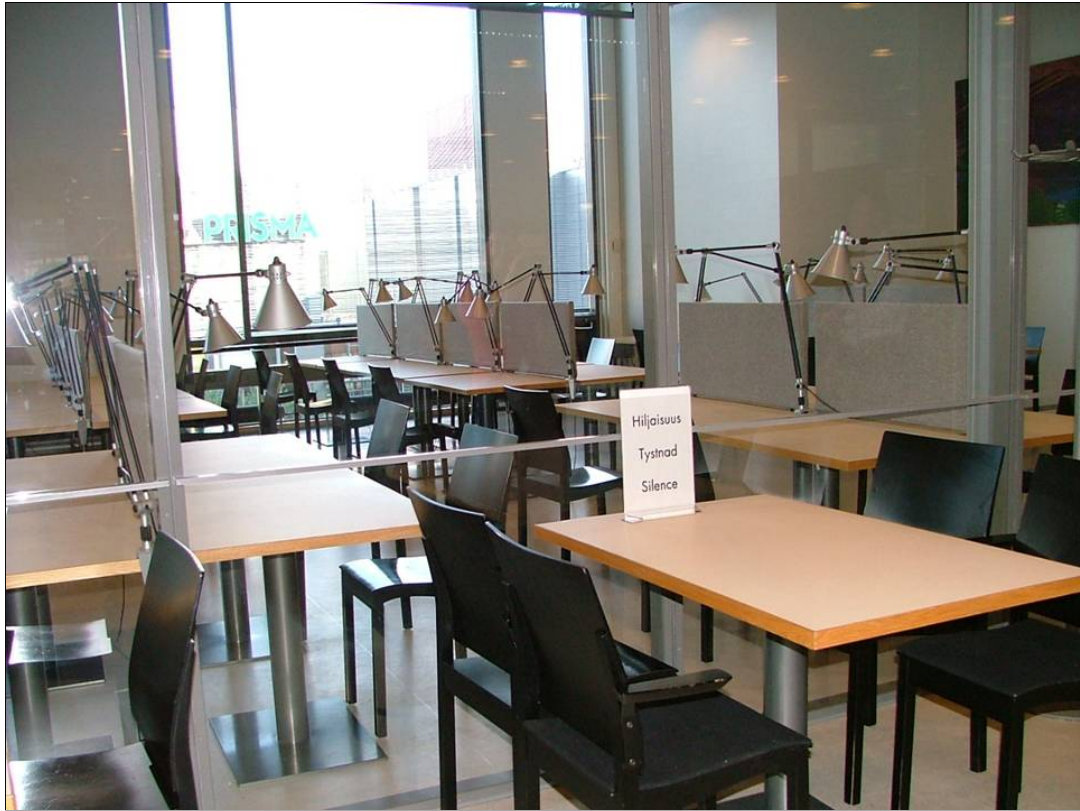
The enclosed quiet study area in Sello Library, with desks for 40 people.