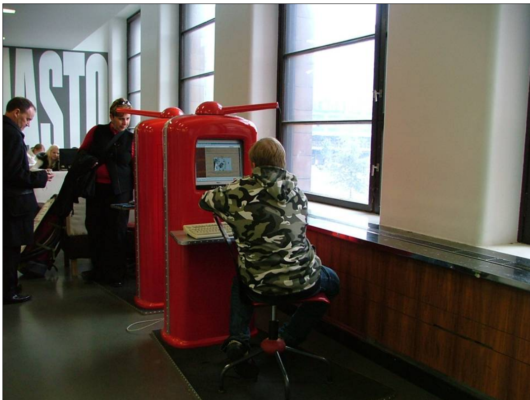
Information Gas Stations at the entrance to Library 10.