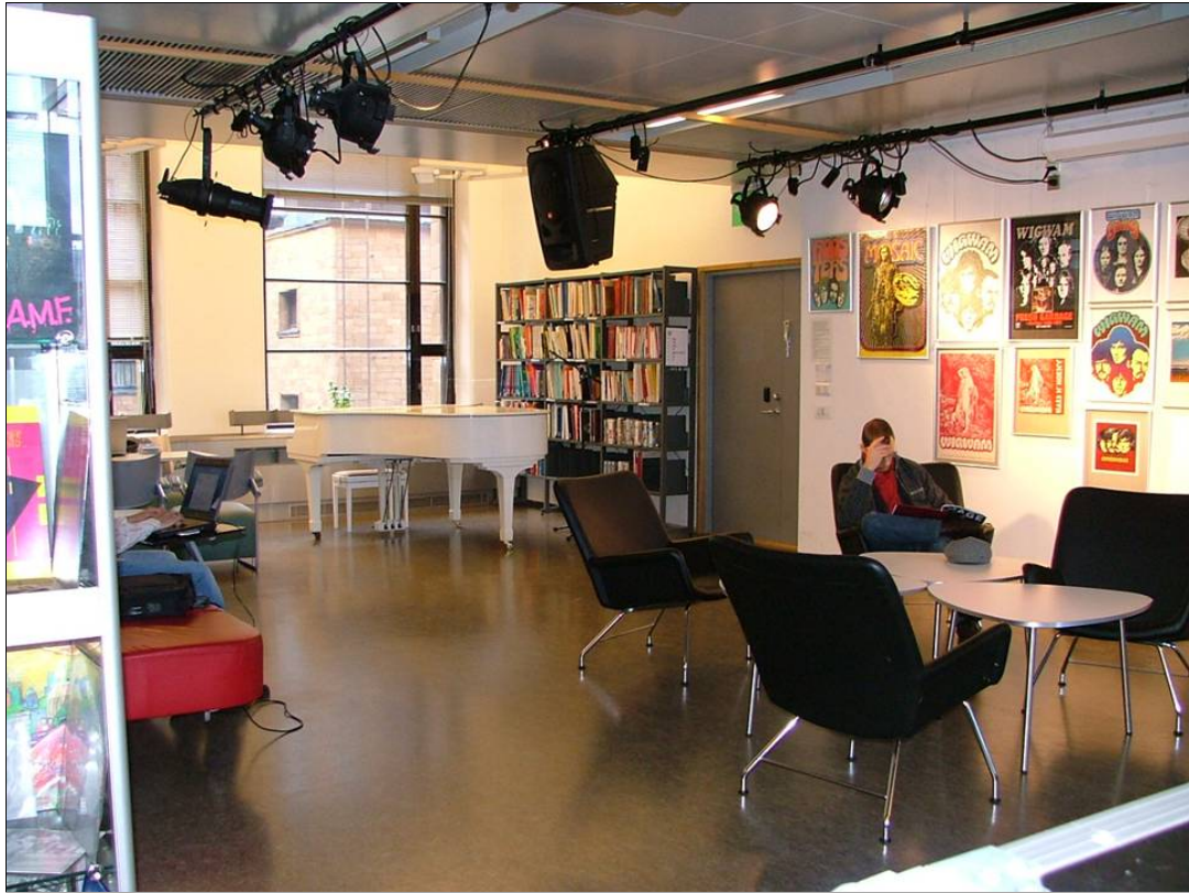
The performance space at the rear of Library 10 – used every day.