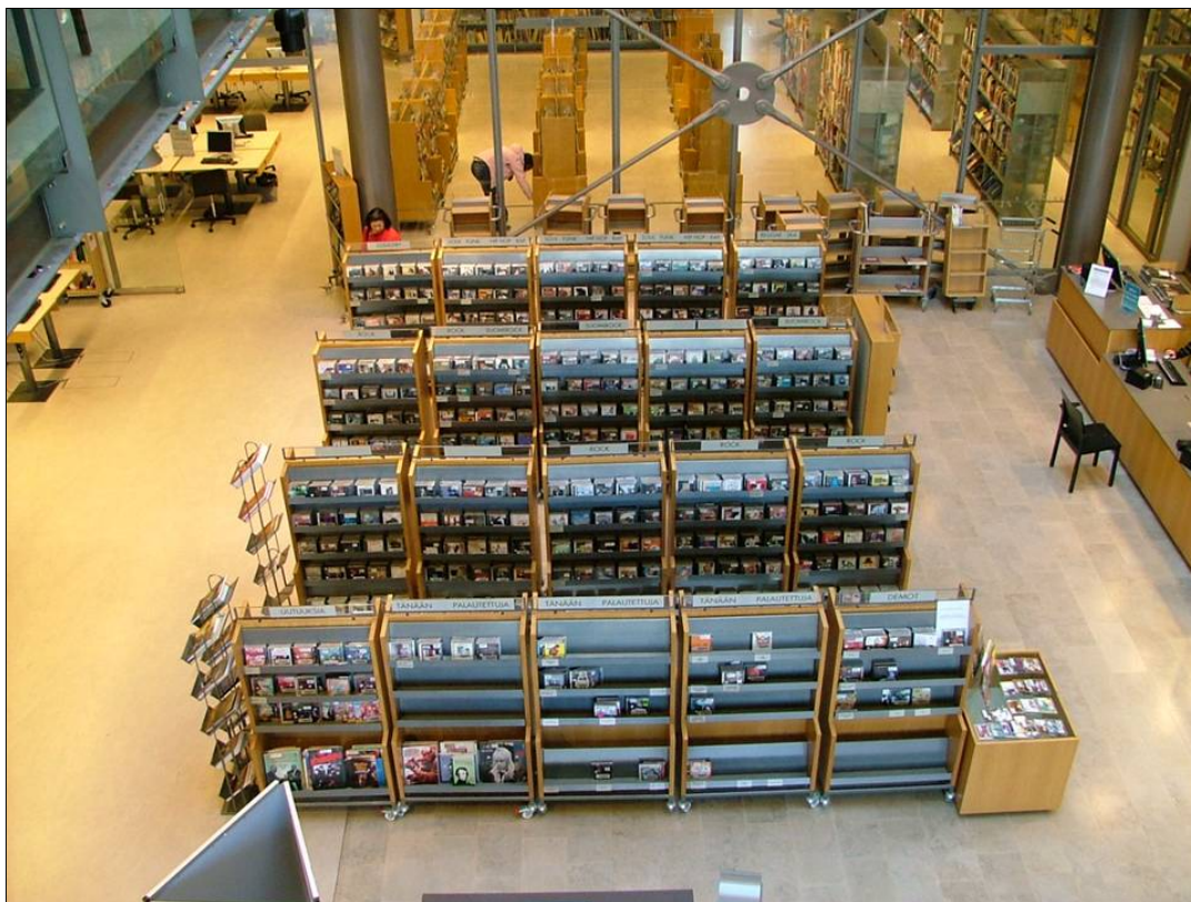
Looking down on the huge audio visual area in Sello Library.