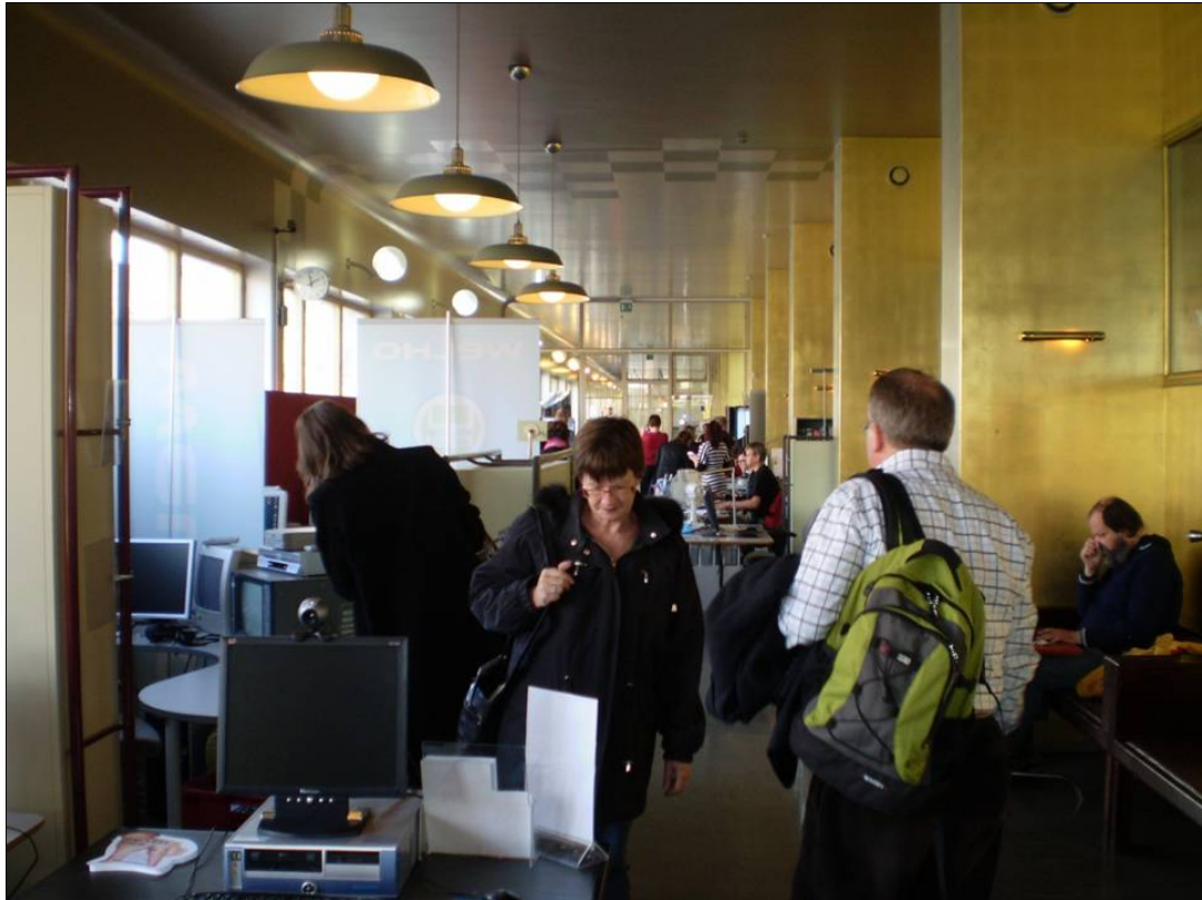
Inside Meetingpoint@Lasipalatsi. It's a long, narrow facility rather like a corridor.