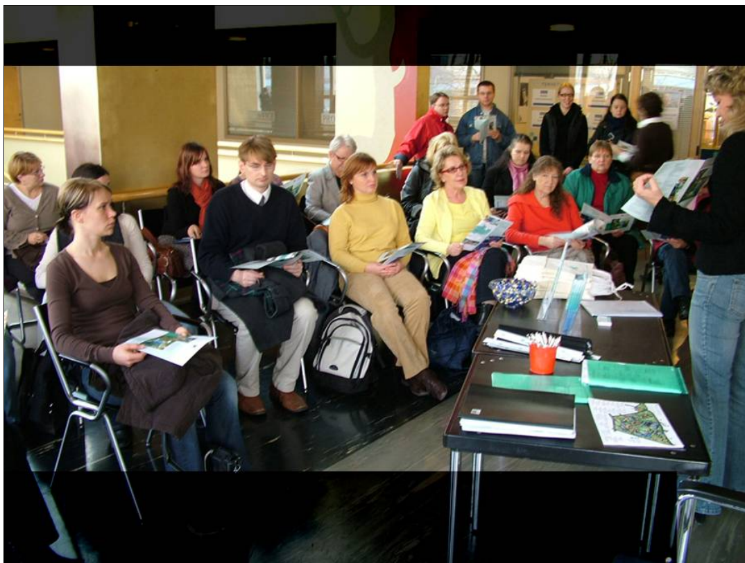
Staff giving a lesson in the classroom of Meetingpoint@Lasipalatsi .