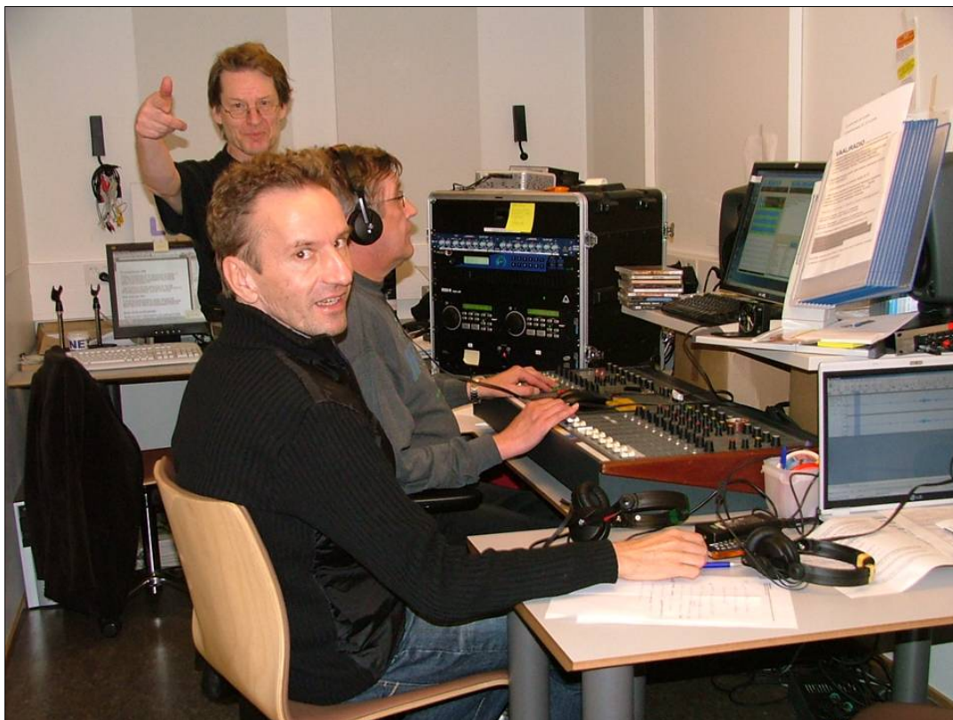
A community radio station runs out of Library 10.