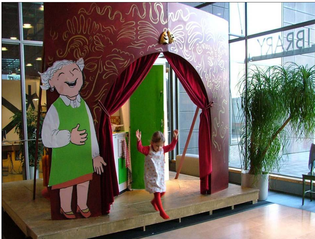
Another photo of Sello Library's temporary exhibition.