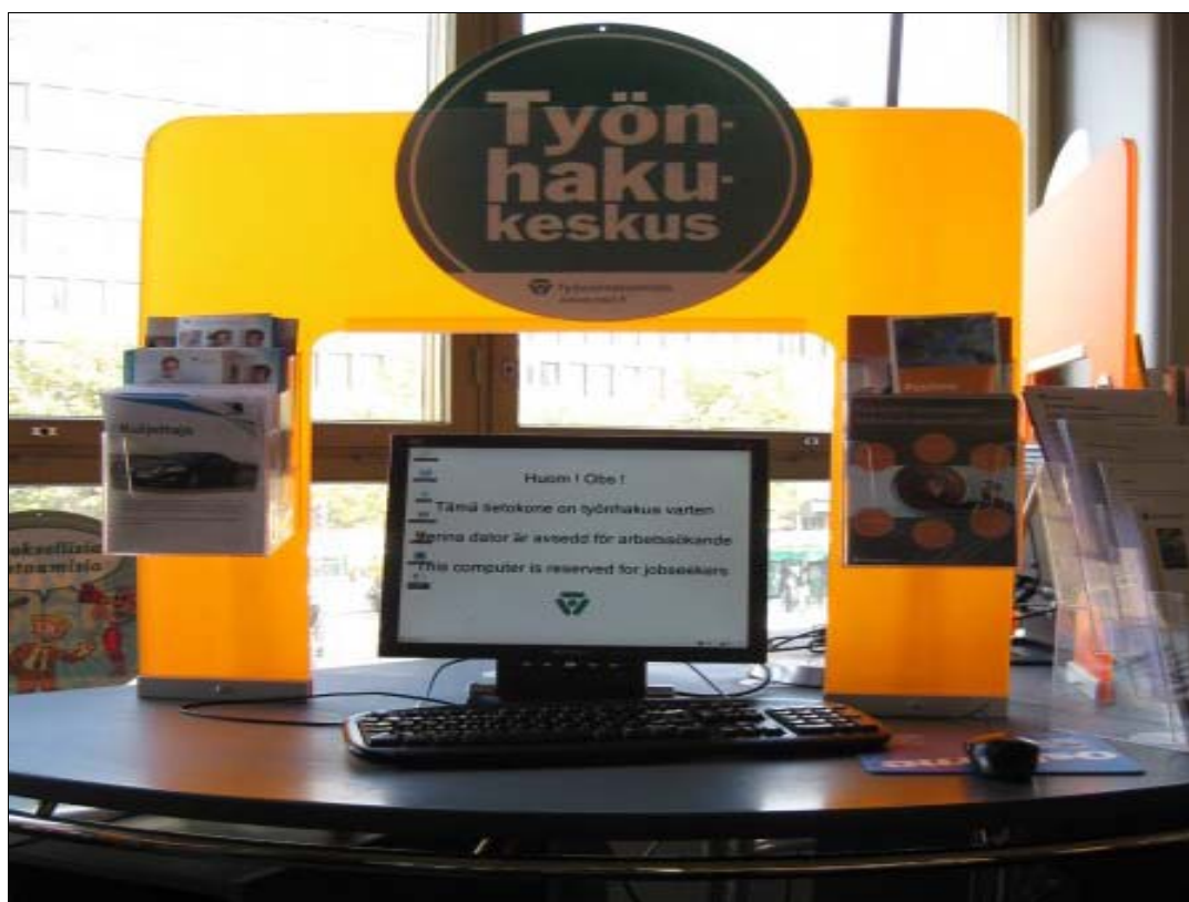
One of the computers reserved for job seekers.