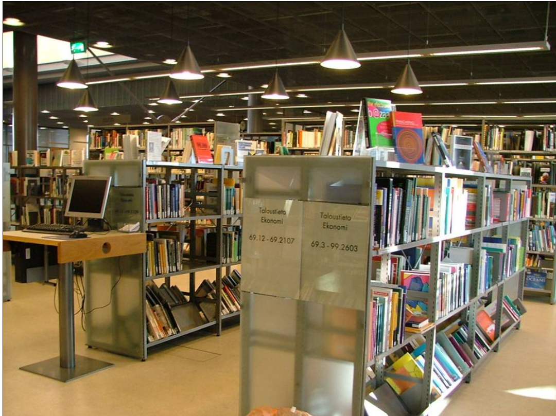
The non-fiction collection area in Sello Library.