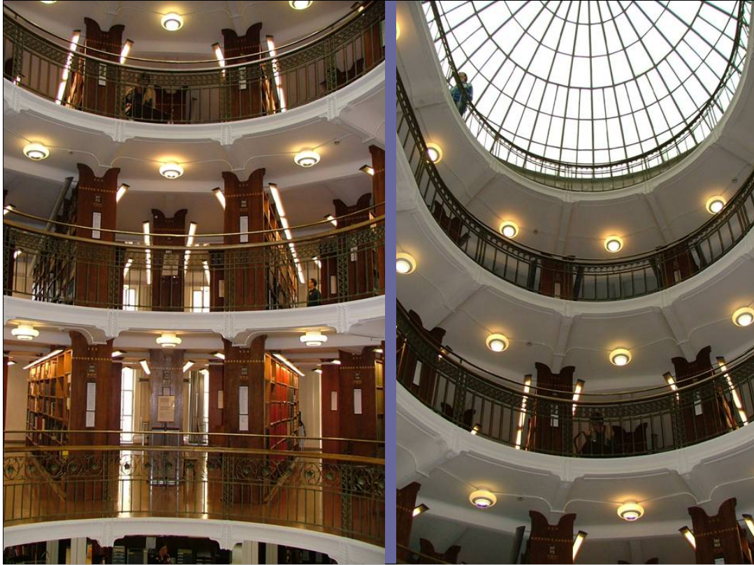
In 1903 Finland's Royal Library was extended. The Rotunda is built on six levels and features a beautiful glass domed roof.