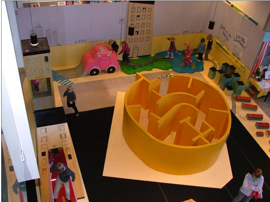
Children playing in Sello Library's temporary exhibition.