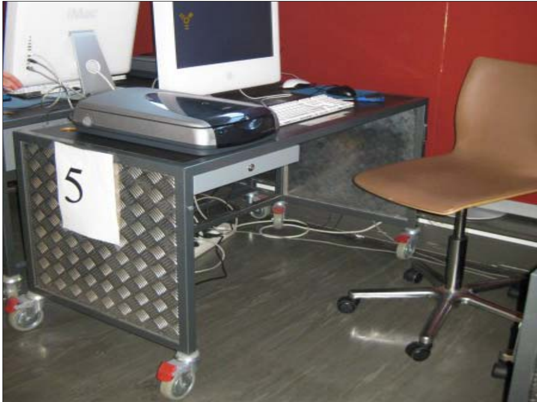
A workstation for library users.