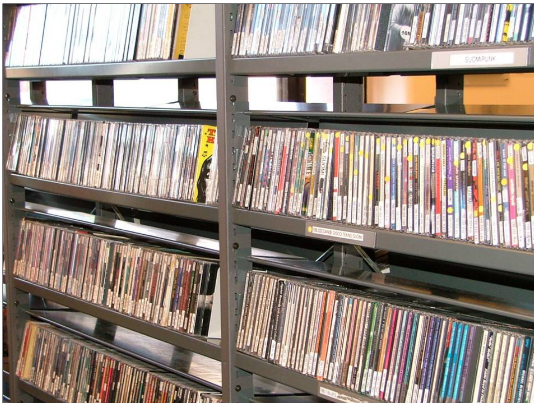
Library 10 provides loads of music – in all formats.