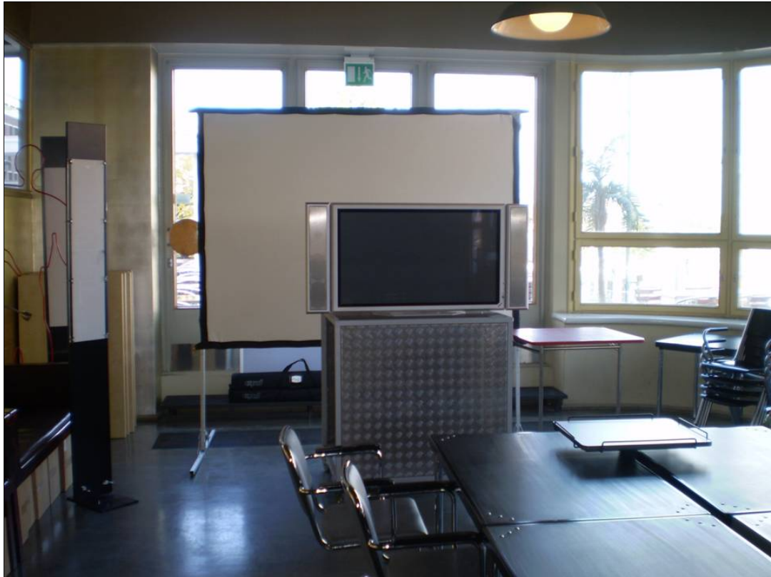
The 'classroom' in Meetingpoint@Lasipalatsi.