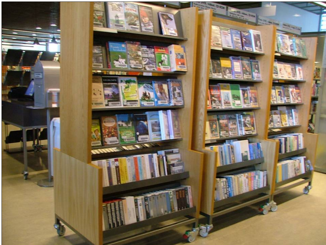
Mobile display shelving in Sello Library.