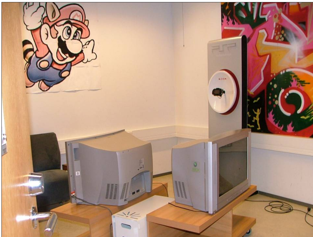
The games room at Sello Library.