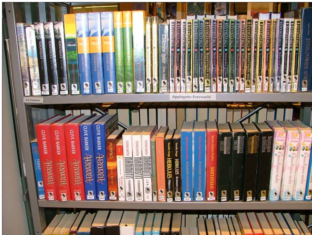
Items in the Young Adult Fiction collection at Sello Library – mostly English language authors translated into Finnish.