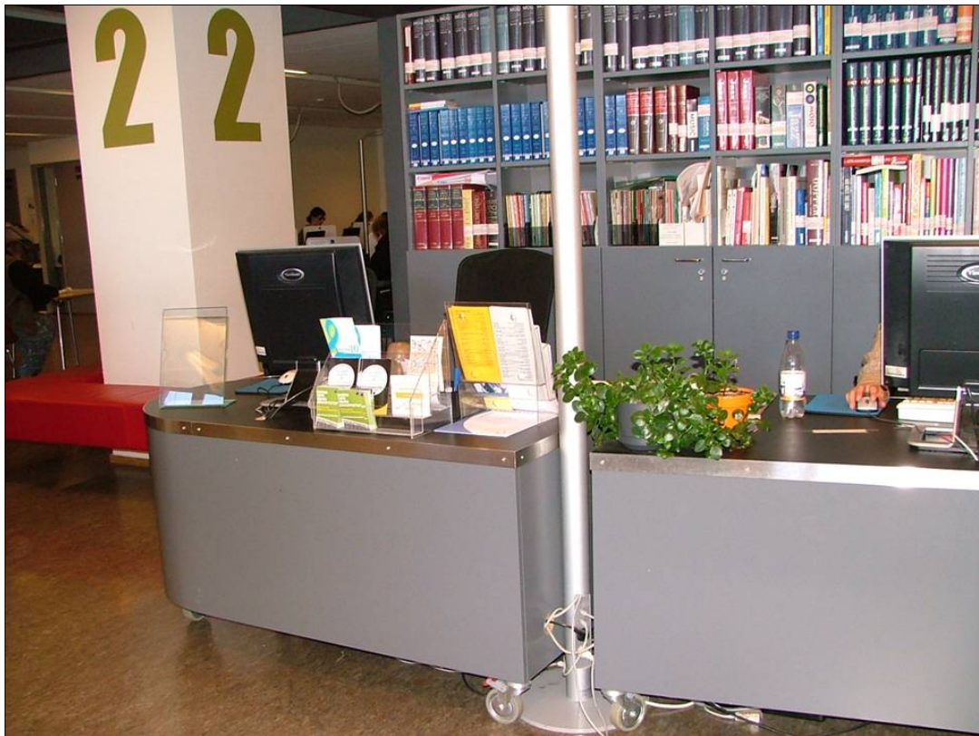
Even the main information desk is on wheels.