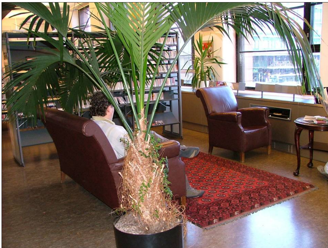
The classical music section in Library 10 is decorated accordingly.